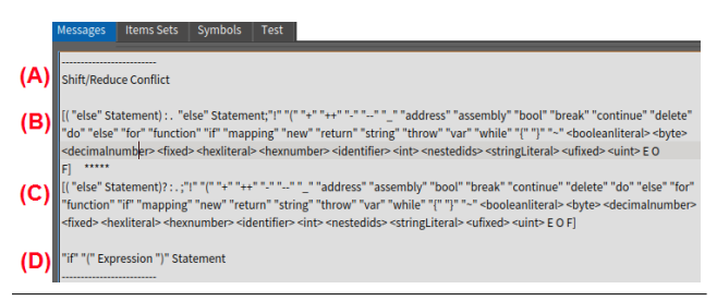
Figure 1. SmaCC Shift-Reduce Conflict Message

First, we need to identify the rule and which part of it is causing the shift-reduce conflict. Unfortunately, the message provided by SmaCC on the conflict might be difficult for a beginner to understand (Figure 1).